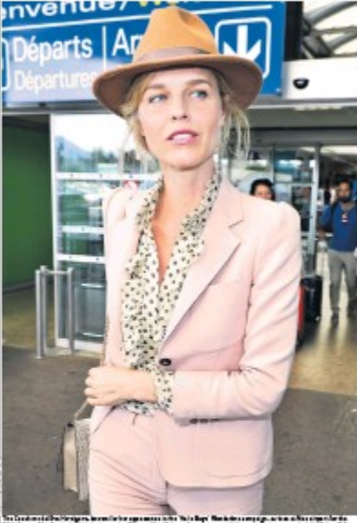
The actress Pippa Middleton is seen here in an airport terminal. She is wearing a hat and a pink jacket. She is standing in front of a sign that says "Départs" and "Départures".